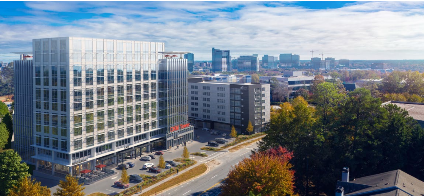
HIGH-DENSITY OPTION (10 STORIES)

Situated at the intersection of Barfield Road and Mount Vernon Highway, with best-in-class access to and visibility from GA 400, One NorthPlace offers ultimate flexibility in size and uses.