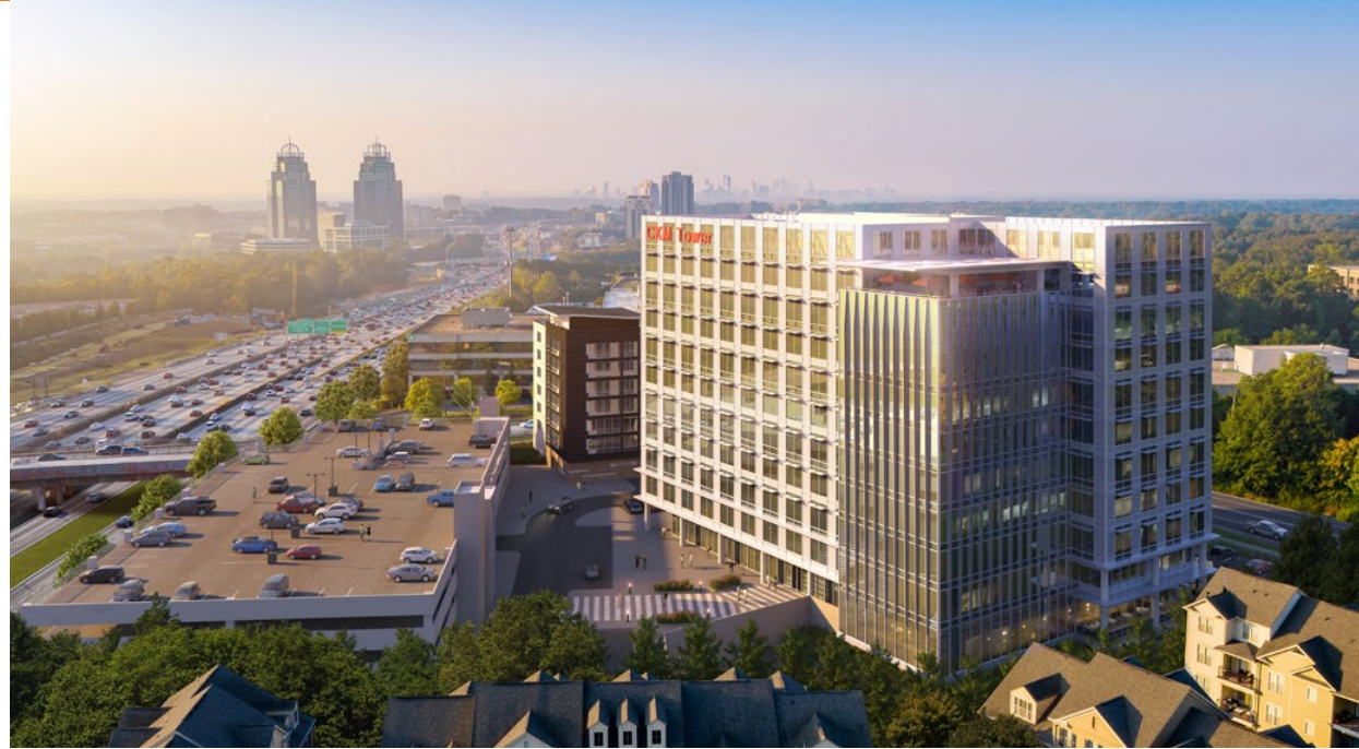
HIGH-VISIBILITY SIGNAGE OPPORTUNITIES