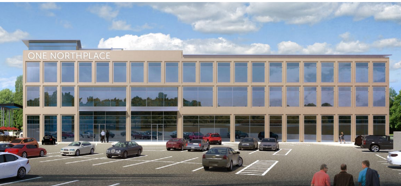
LOW-DENSITY OPTION (3 STORIES)